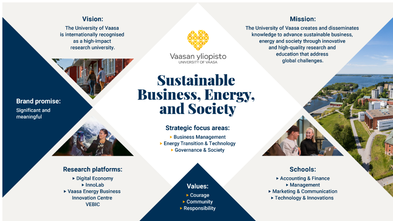
Figure 2. Overview of the University of Vaasa Strategy 2030.